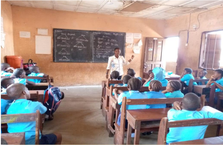
(Our V4J Facilitator having a general meeting session with the upper primary school pupils at FAWE)