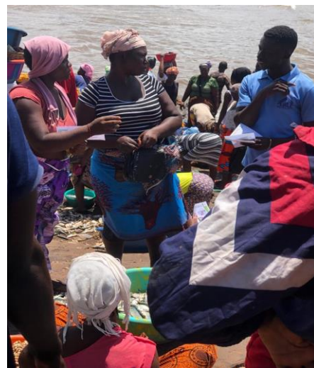
(Our Social Worker during the Awareness-Raising at Funkia - Goderich)

Our awareness-raising team has been diligently working to protect and safeguard those at risk, including individuals with disabilities.