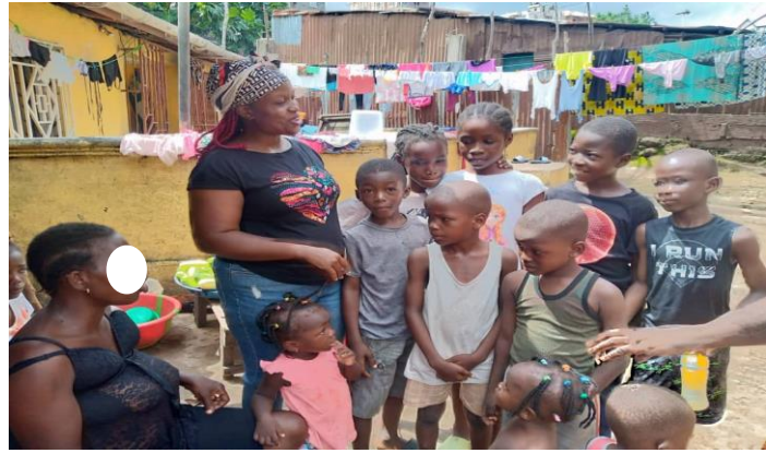
(Ensuring that no child is left behind regardless of the age or gender)

One of the most inspiring aspects of our efforts this quarter is the diversity of the communities we have touched. We believe in the power of unity and solidarity, knowing that ending violence against women and children requires the collective effort of everyone.