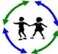
Child Right Coalition