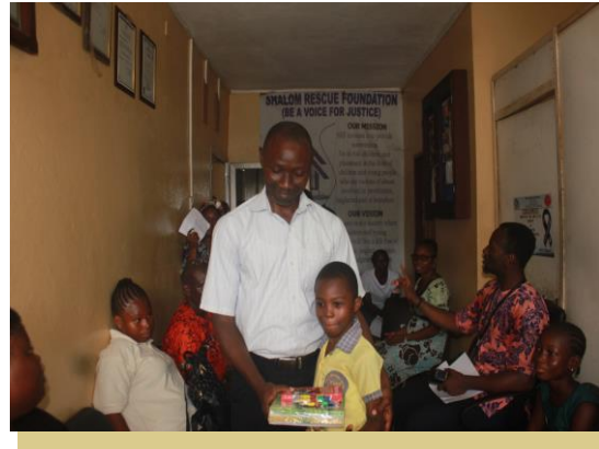
(The programs Coordinator distributing School supplies)

A significant highlight was the review of the Shalom Rescue Foundation Child Safeguarding Policy. We were proud to witness all our associates signing their commitment to ensure the safety and protection of every child.