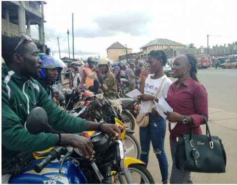
(Staff and Volunteers engaging bike-riders at the Western Rural/Waterloo 5/5 & Tombo Junction)