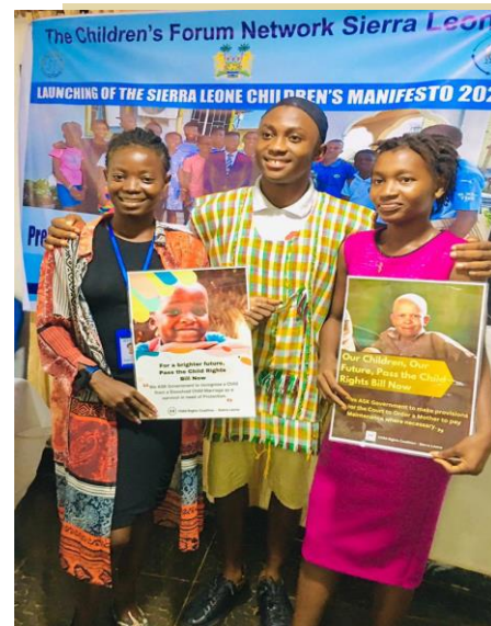
(SRF at the launching of the Children’s Manifesto)

As a member of the Child Right Coalition, SRF and other partner organization launched the Children’s Manifesto.