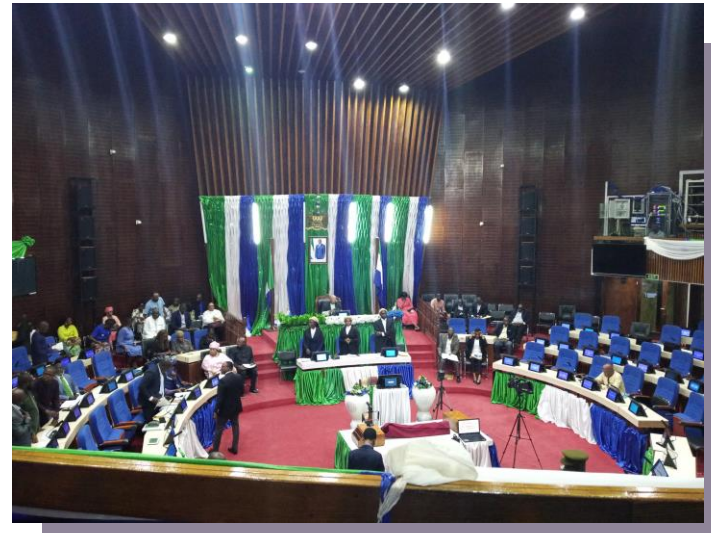
(SRF in attendance as Parliament was called in Session)

Shalom Rescue Foundation being a member of the Child Right Coalition joined other CSOs to witness the presentation of the Report by the Legislative Committee to the House of Parliament.